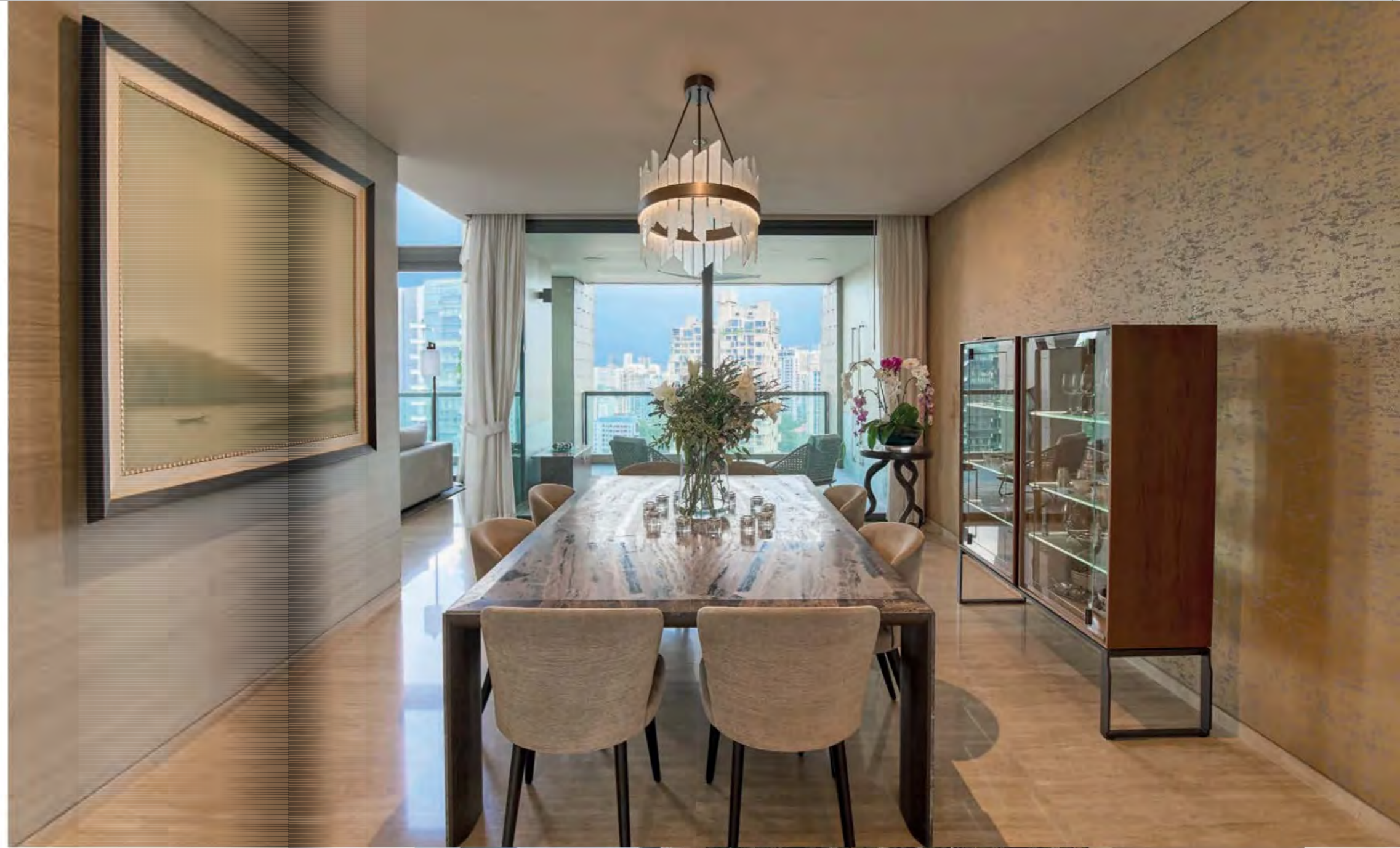
Clockwise from top right: Art was an important consideration in each space, including the dining area; in the study, wallpaper from Florence Broadhurst creates a sense of whimsy and makes an artistic statement; the home's materials and finishes were chosen to promote a sense of well-being and relaxation

The bedrooms were designed as luxurious retreats. The master bedroom features a custom wallcovering by Emma Hayes, adding a unique touch to the space, while a walk-through wardrobe is decked out in two extravagant marble finishes. One guest room pairs the Les Rues de Zanzibar wallcovering from Misia Paris with the elegant Xi table