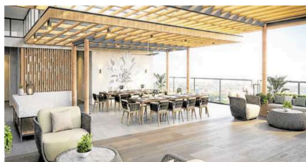
Artist's perspective of Two Botanika Sky Lounge